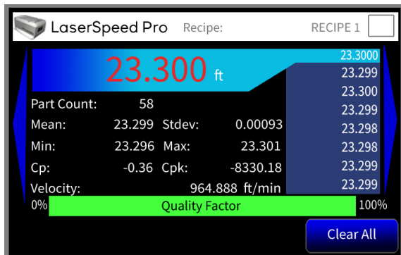
Discrete Part Length

Easily configure LaserSpeed Pro operating parameters. Capture and display important gauge and process data, such as length, velocity, quality factor and gauge status.